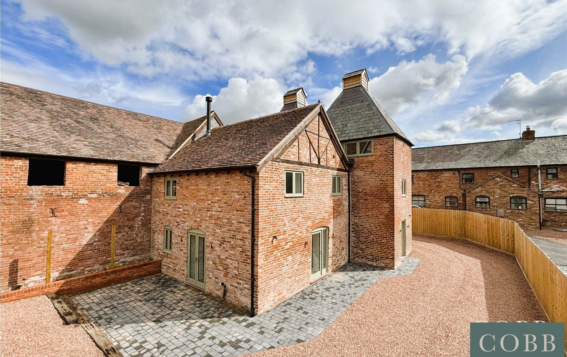
The Old Oast House, Burford, Tenbury Wells, WR15 8HH Offers Over £550,000